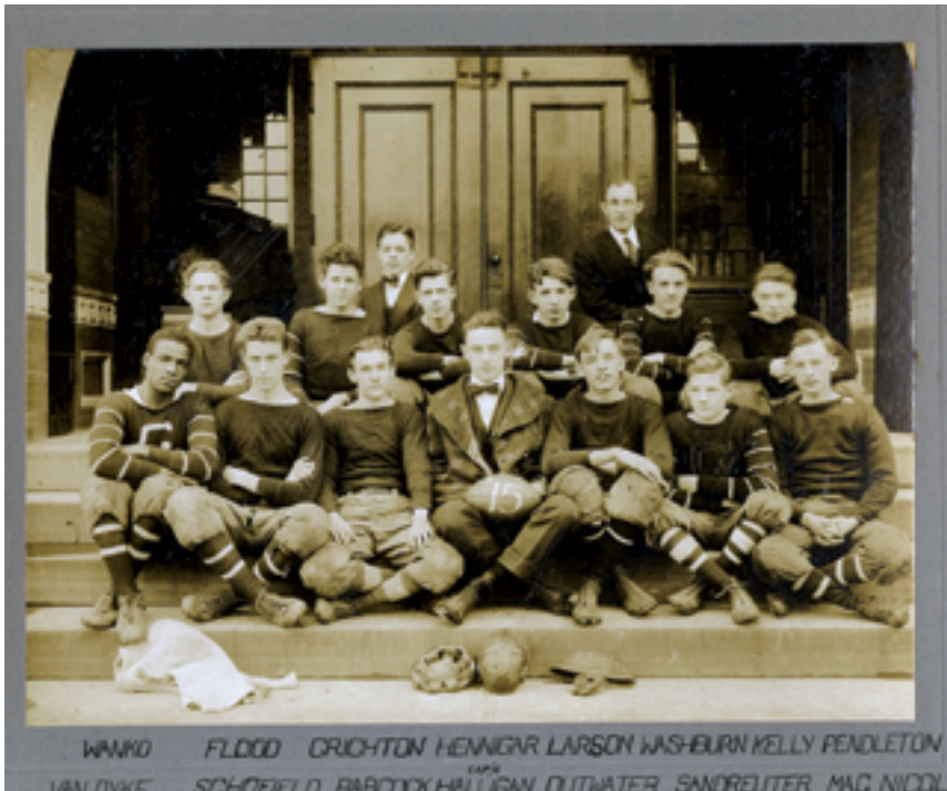
Greenwich High School Football Team, 1915.